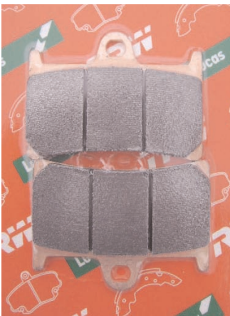
Lucas TRW Front TRW-PAD-F £25.00 per set

LUCAS TRW HH Sintered Pads have been tested by the club in the ultimate way. These pads are the very same pads that the club FJ Race Team use on their race bikes and are the best we have found for increased stopping and good feel whilst braking so far. They work well in all conditions and adverse wear of the pads and discs has not been found to be an issue This pad is only available to fit