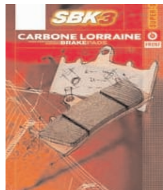
CL-PADS Front pads £28.00 ( 06>models)