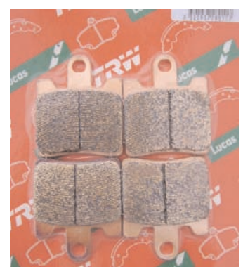
TRW PADS Front pads £39.00 ( 06>models)