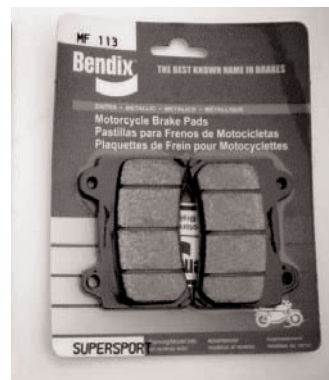
F-PADS front pads £19.00 (01-05)